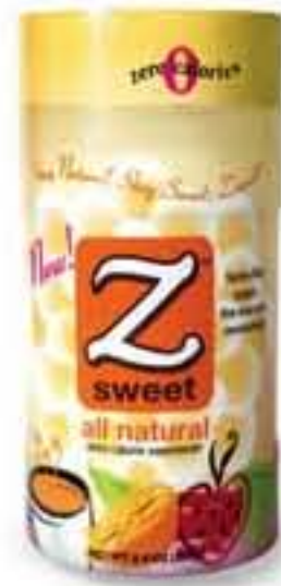
Z Sweet and Z Sweet Organic All-Natural Sweetener: Ventana Health, San Clemente, Calif.; Suggested retail price for a 7.0-oz. box of 50 packets is $9.99

Overall, our reviewers reacted favorably to Z Sweet as a no-calorie alternative to sugar and even as a preference over aspartame-containing sweeteners.